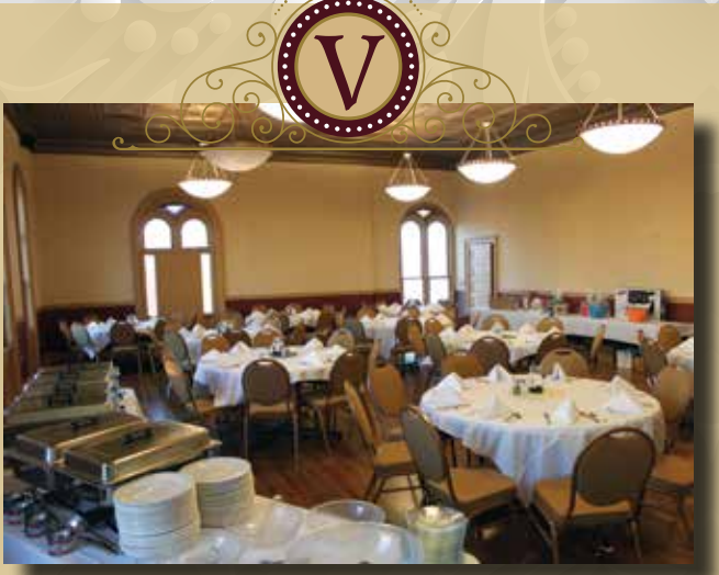
The 1870's Room