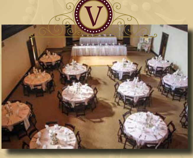
Bower City Ballroom